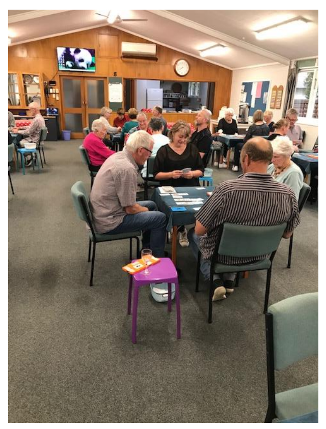
All up a pretty worthwhile night...well a great night to get away from a wind ravaged Te Aroha....and the good news is that next November, Te Aroha will host the event.