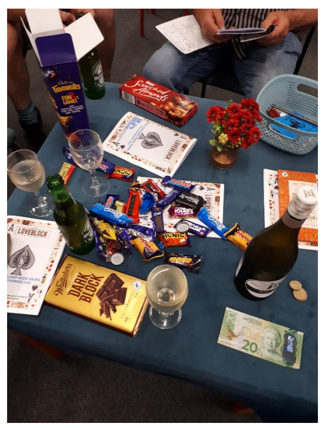
maybe that $20 note was to fill that empty glass!